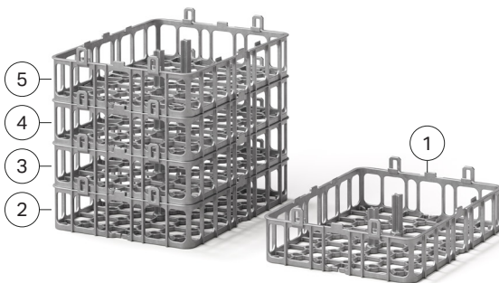
Step 3 – Unloaded Stack